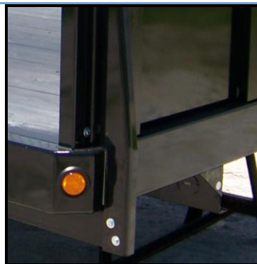
Toughline Knee Brace Gusset