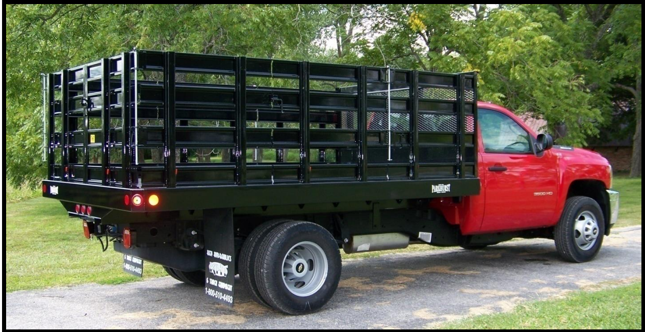
PTW9612 shown with RC409612

Parkhurst Stake Racks are easy-to-use and make hauling your commodities secure and trouble free. They're extremely versatile and used in a variety of applications and industries, including plumbing supplies, hardware, lumber, and heating and cooling—just to name a few. Call your local distributor and go check out the features of the Stake Racks. Put one on your truck today!