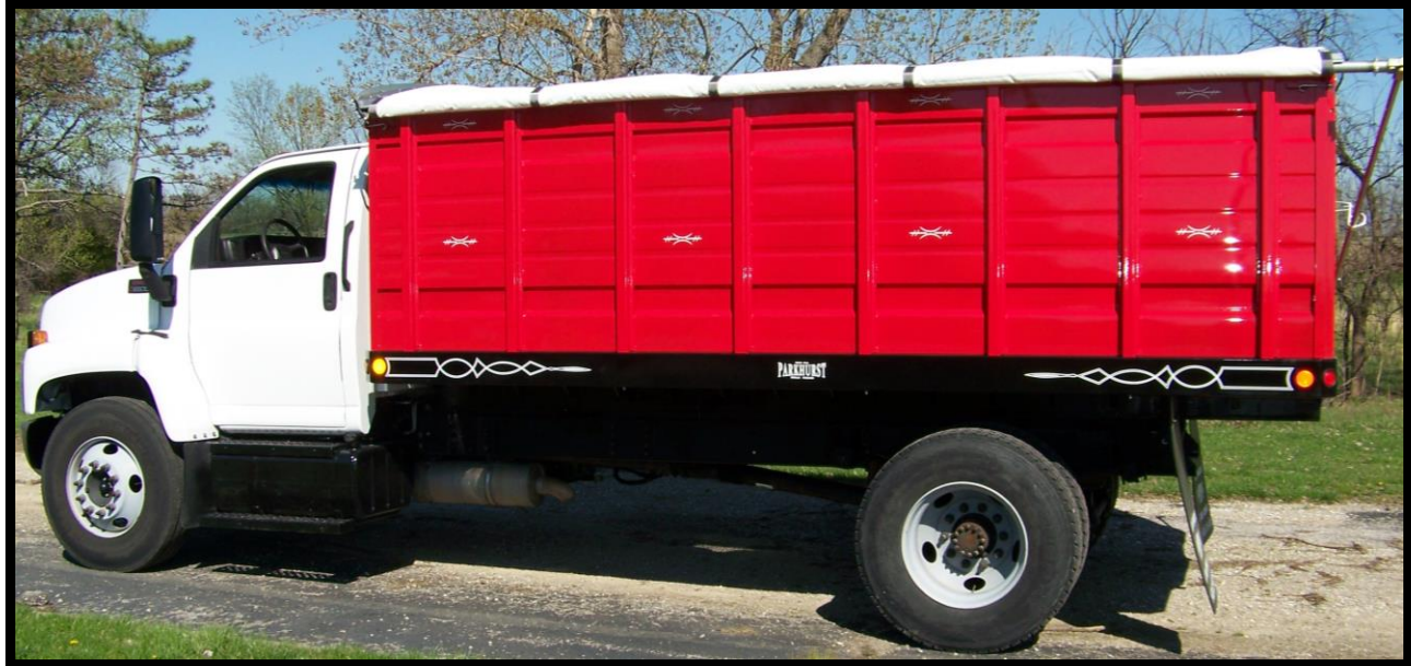
PTS9616 shown with RG529616

Parkhurst Stake Type Grain Racks offer a proven design for durability, strength and large payloads. The Stake Type Grain Racks will haul all your commodities from the field to the bin or elevator. Add a triple cargo door or for more capacity, 10" tip top extensions are available. Easily remove the racks during off-season and use the heavy duty flatbed for your other hauling needs. Call your local distributor and go check out the features of the Stake Type Grain Racks. Put one on your truck today!